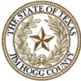
Jim Hogg County