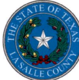
La Salle County